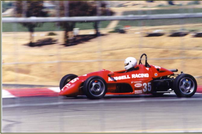
Could it be Michael Andretti?