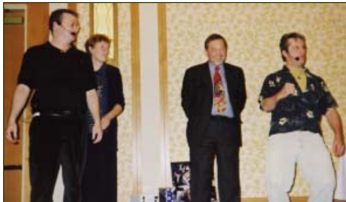
Two of our members on stage with improv team Rock Paper Scissors.