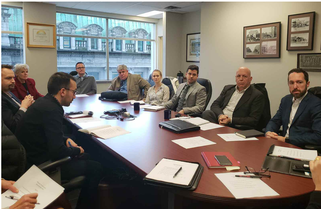
BOMA met with other business associations to discuss property tax solutions

In response to property taxes increasing at unsustainable rates for small businesses, BOMA recommended the City of Vancouver Councillors consider a 2% shift in the tax rate from businesses back to residents.