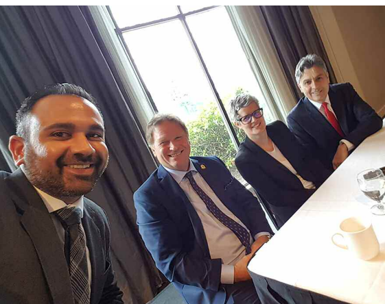
BOMA hosted a forum with Greater Victoria mayors from Langford, Victoria and Saanich

We have established new and stronger relationships with the Office of the Superintendent of Real Estate and the Real Estate Council of BC to ensure that the voice of the commercial property management sector is well represented in new policy and licencing discussions.