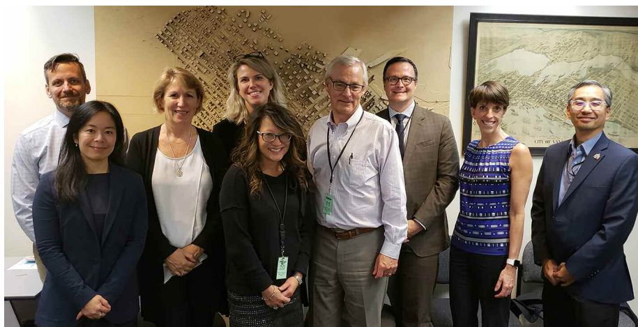
BOMA Board members meet with City of Vancouver planning staff on permit wait times.

BOMA has been working with the City of Vancouver on solutions to speed up the development permit process which has resulted in a strategic plan to be implemented in the coming year. In addition, BOMA continues to have a representative on the Urban Design Panel to help ensure the industry has a voice when new developments are being considered in Vancouver.