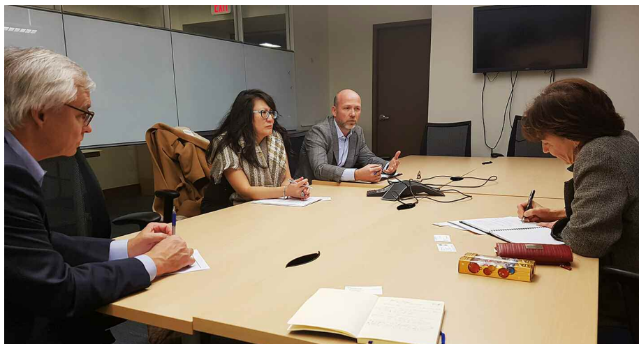
Meeting with the City of Vancouver on tax proposals.