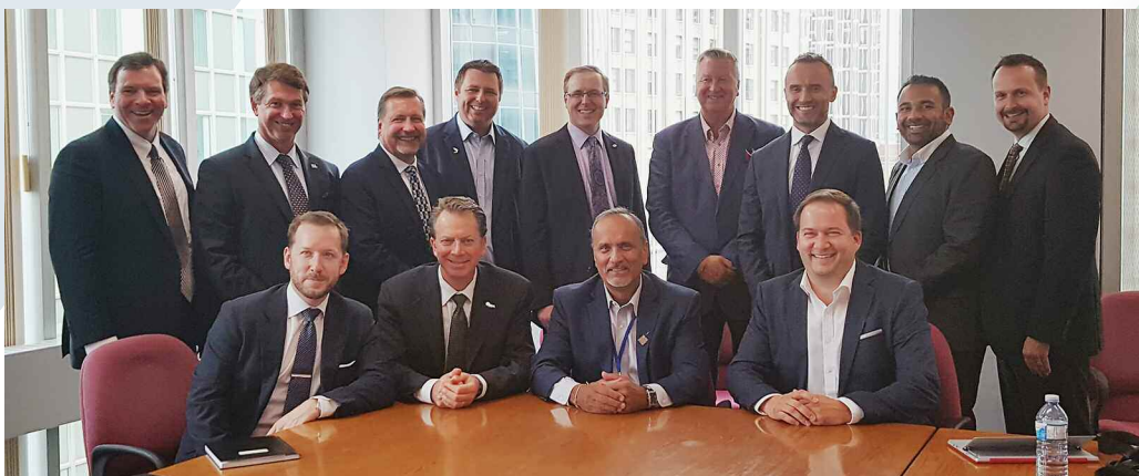
Coalition of BC Businesses Strategy Group.